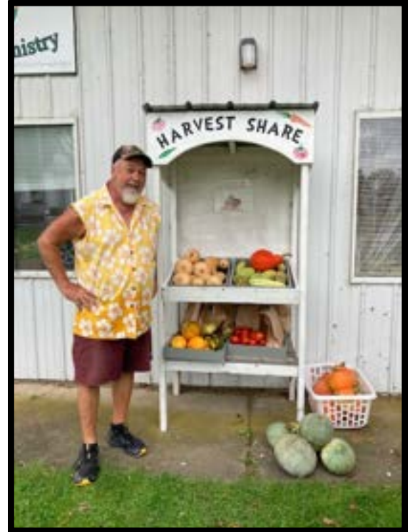
Your local farmers and gardeners supply us with fresh produce to share.