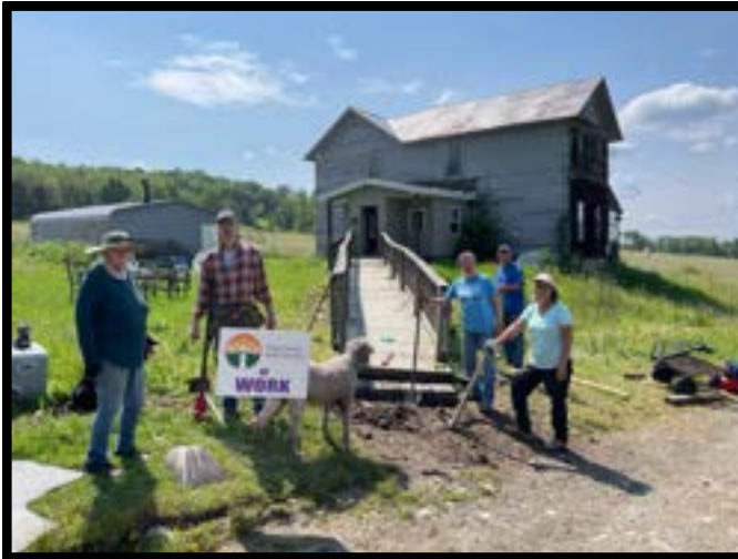
Our volunteers build ramps to improve accessibility to homes.