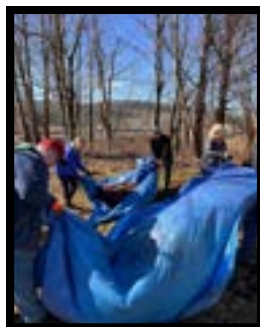
CENTER: Tri-Town Insurance employees aided our Spring Cleanup for seniors.