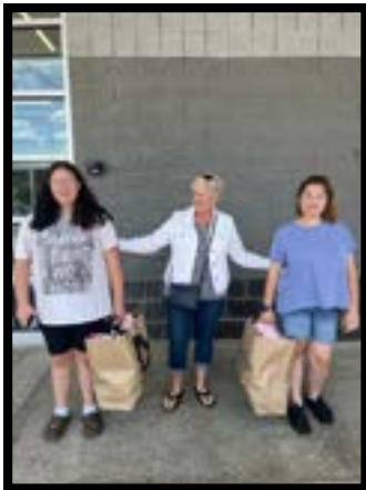
Families can receive financial assistance to buy school clothes.