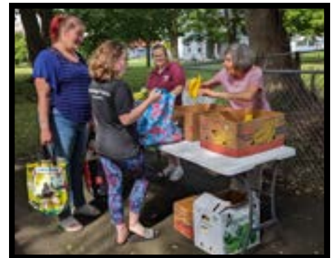
ABOVE: Our August Food Give-Away.