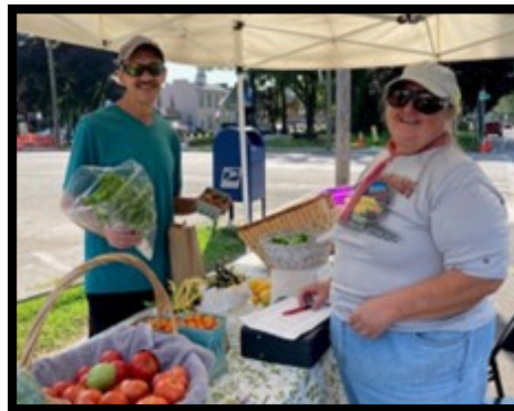
ABOVE: TCRM provides vouchers for food sold at the Owego Farmers' Market.