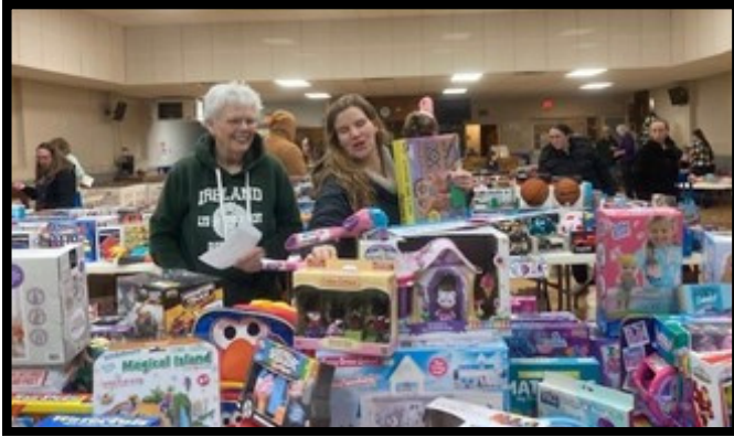
Our Christmas Toy Distribution helps make the season bright.