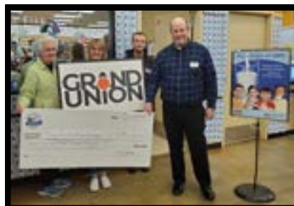
LEFT: Grand Union shoppers gave generously.